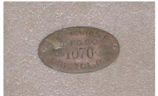
Middle Builder's Plate