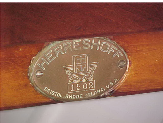
Late Builder's Plate