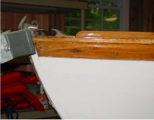
Earlier Bow Chock