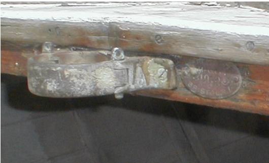
Earlier Mast Partner