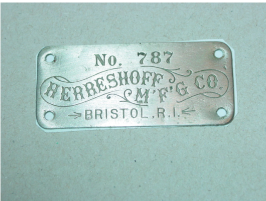
Early Builder's Plate