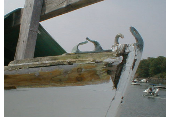
Later Bow Chock