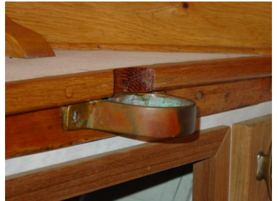
Later Mast Partner